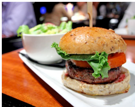
Primrose PATH: The 650-calorie bison burger at Four is one of the underground city's better lunch options

Bay Street gets health-conscious at this subterranean jewel. With nothing over 650 calories, the emphasis is on flavour, not fat By Renee Suen